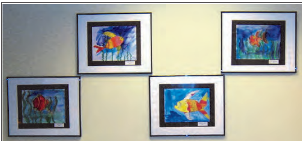
Most of the artwork displayed in Kent Island has a Chesapeake Bay theme.